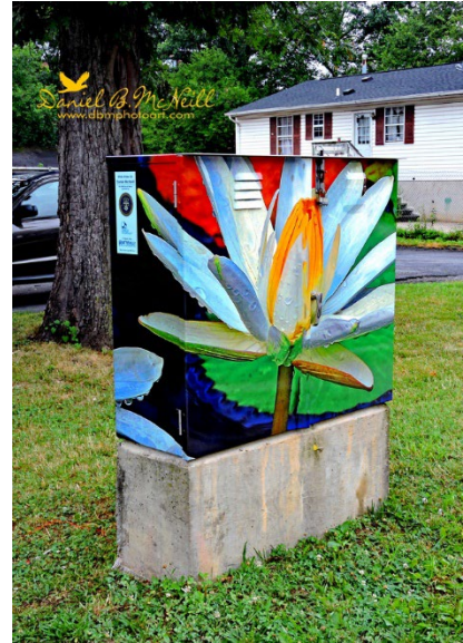
Riverdale Park, MD