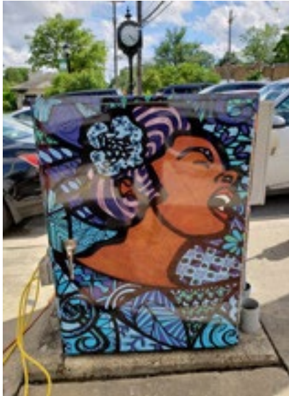
Riverdale Park, MD

These are examples from other calls/wrap projects we have overseen. See our template on next page.