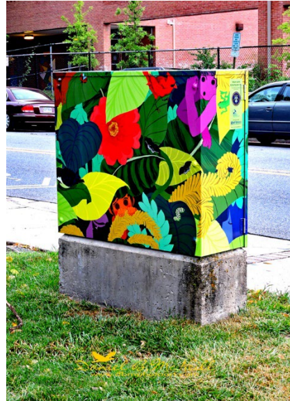
Riverdale Park, MD