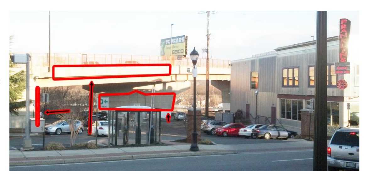
Illustration of 3 locations