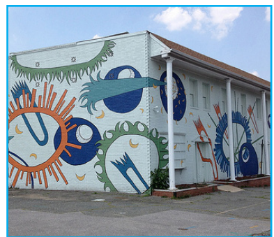
Gateway to the Creative Community, by Citizen Paint Project 4821 Baltimore Ave. (2012)

RUNS JANUARY-JUNE 2013 More info @ www.mygatewayarts.org/street-art